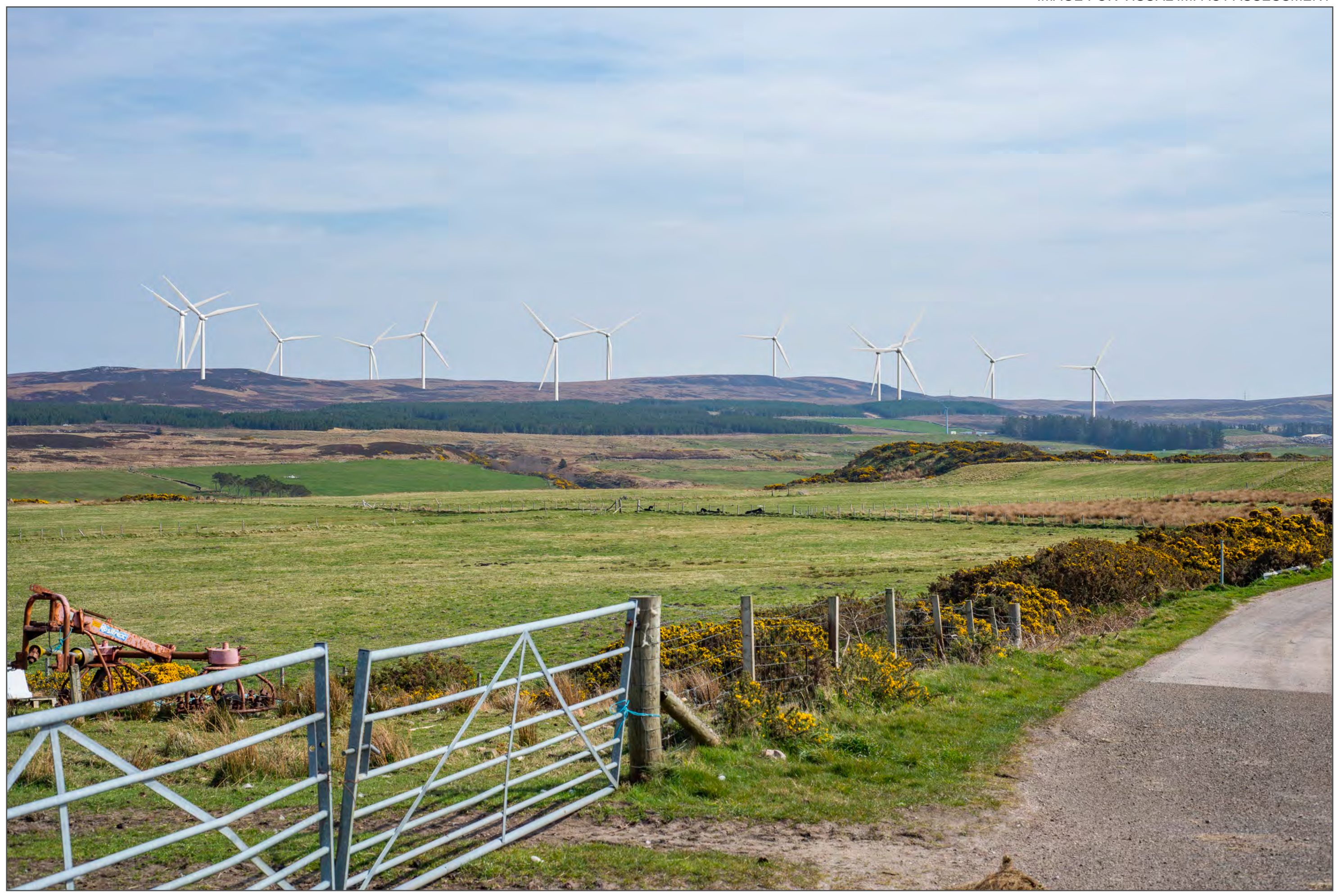
Viewpoint 5 (Figure 6.16h) A836 Melvich