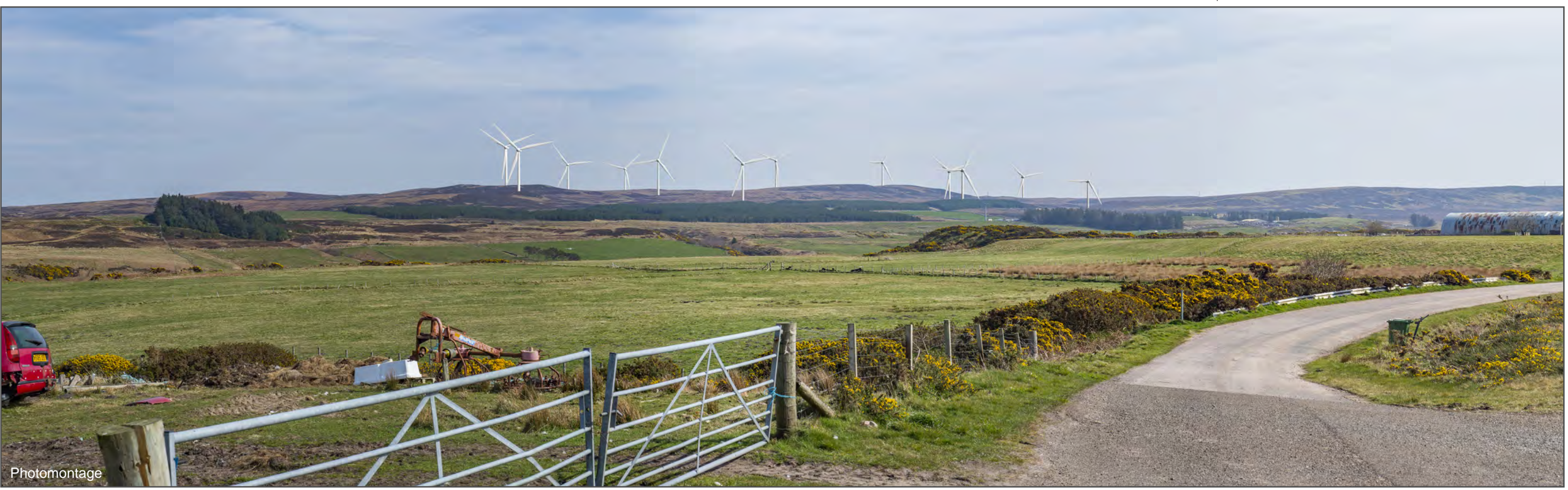
Figure 6.16f Viewpoint 5 A836 Melvich