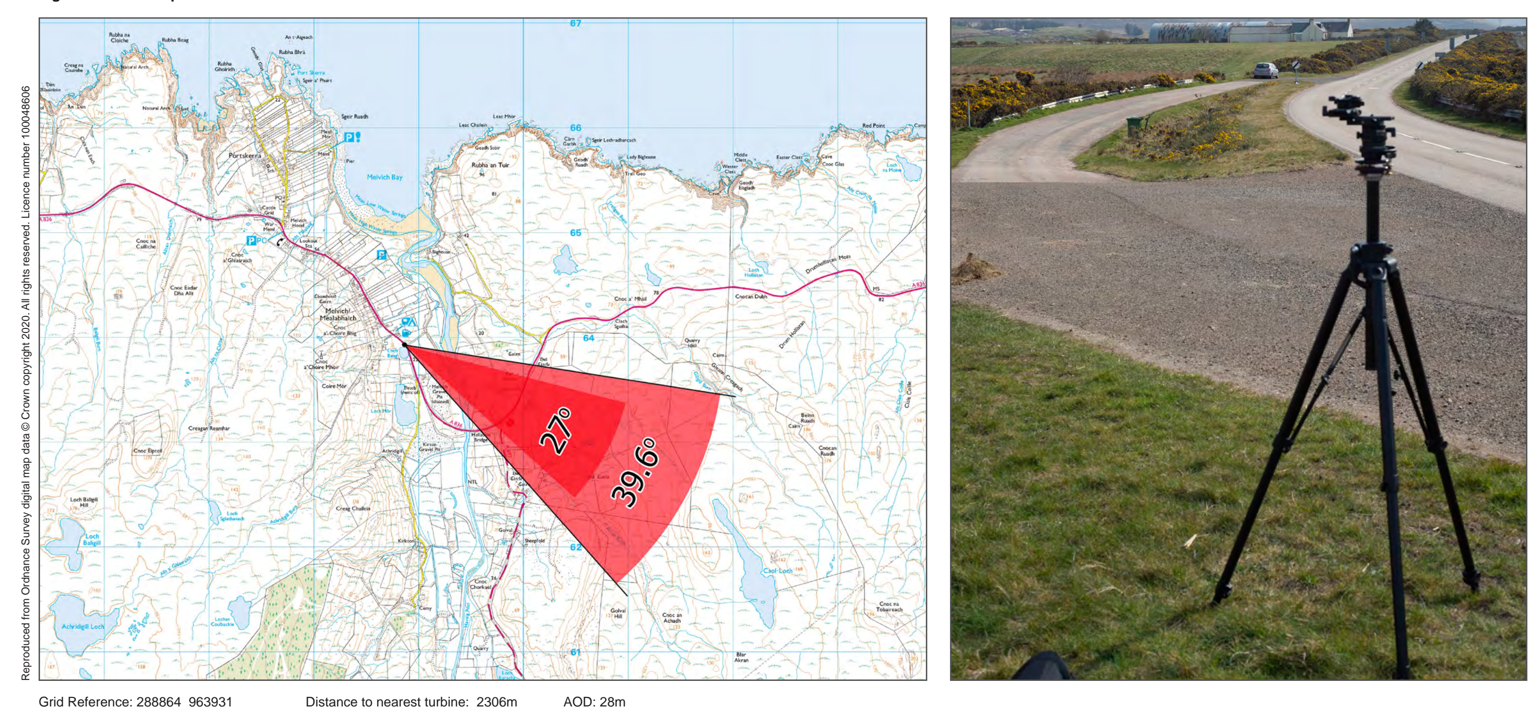
Figure 6.16e - Viewpoint 5: A836 Melvich.

This viewpoint is located approximately 9km west of VP3 at Reay.