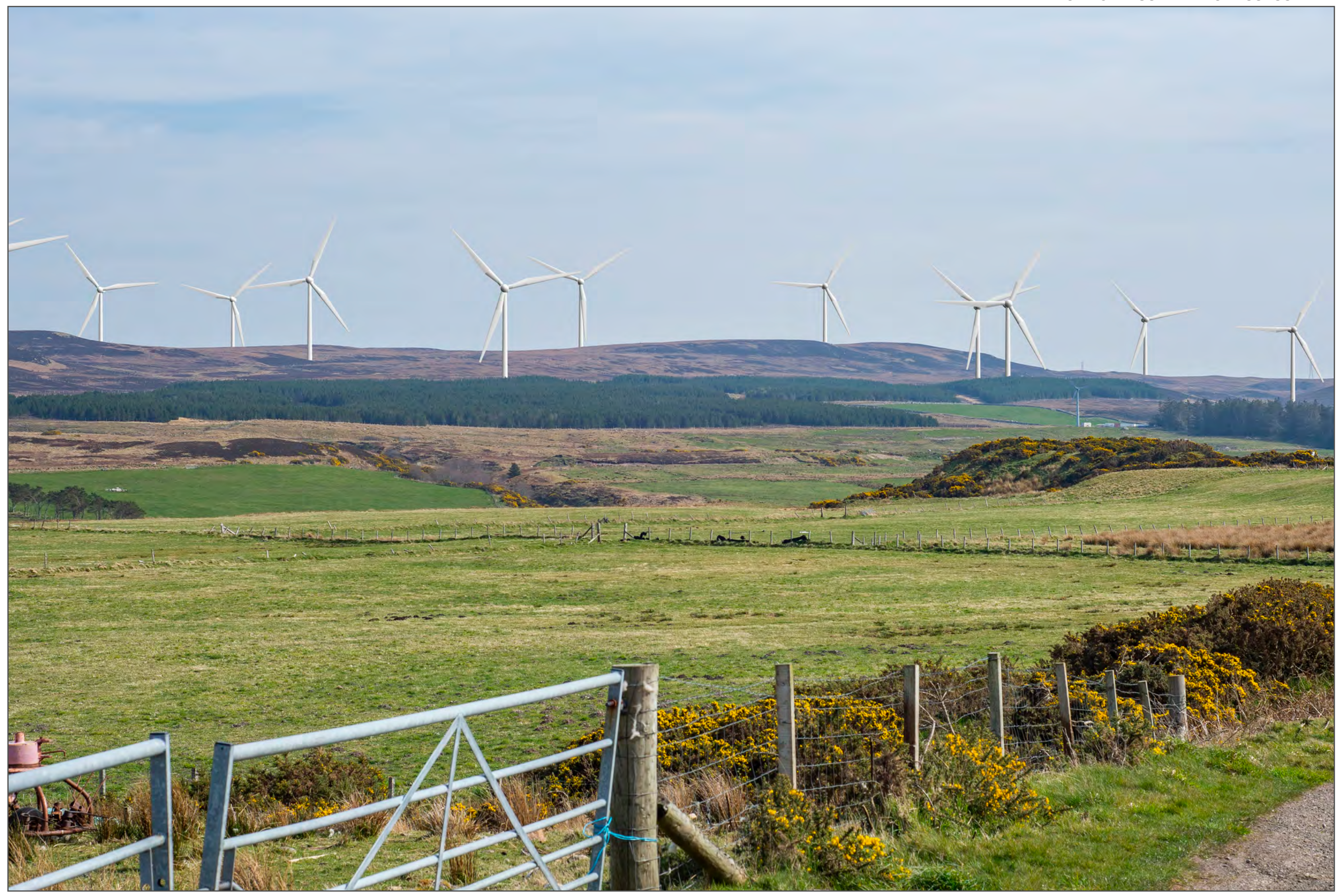
Viewpoint 5 (Figure 6.16i) A836 Melvich