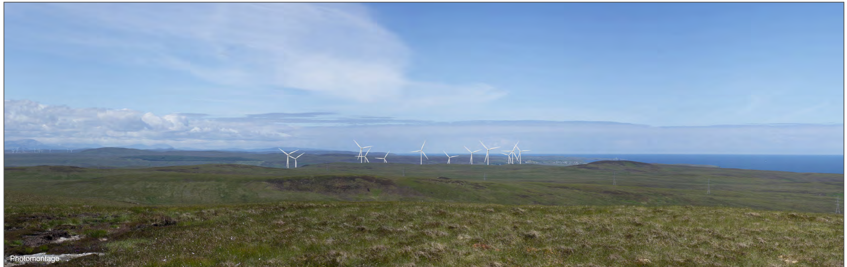
Figure 6.20h Viewpoint 9 Summit of Beinn Ratha

Distance to nearest turbine: 3450m Camera: Nikon D610 Focal Length: 50mm vertical (27°) x 28mm horizontal (65.5°) Camera height: 1.5m Date: 12/07/2019 12:02