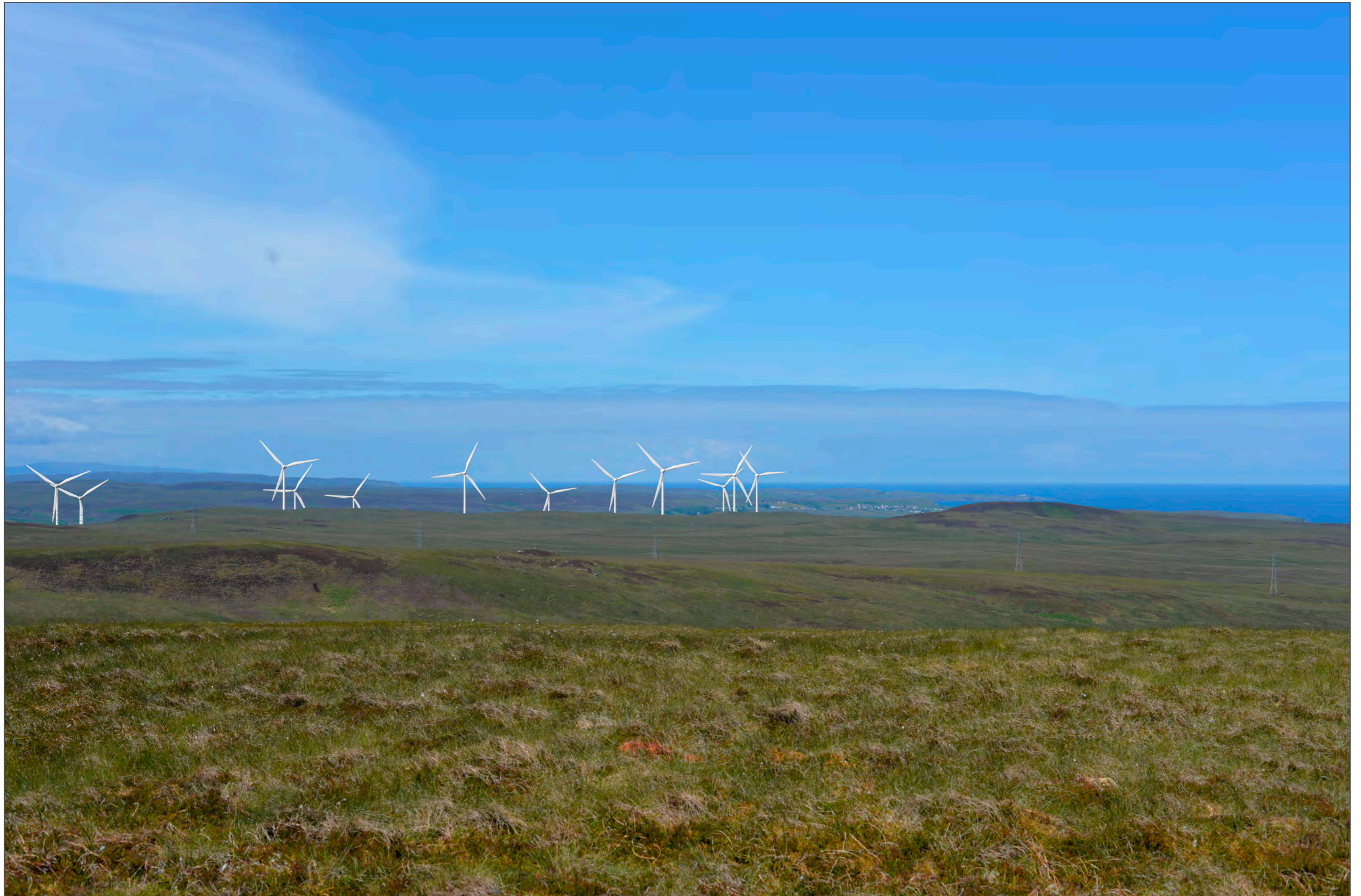
Viewpoint 9 (Figure 6.20j) Summit of Beinn Ratha

Distance to nearest turbine: 3450m Camera: Nikon D610 Focal Length: 50mm Camera height: 1.5m Date: 12/07/2019 12:02