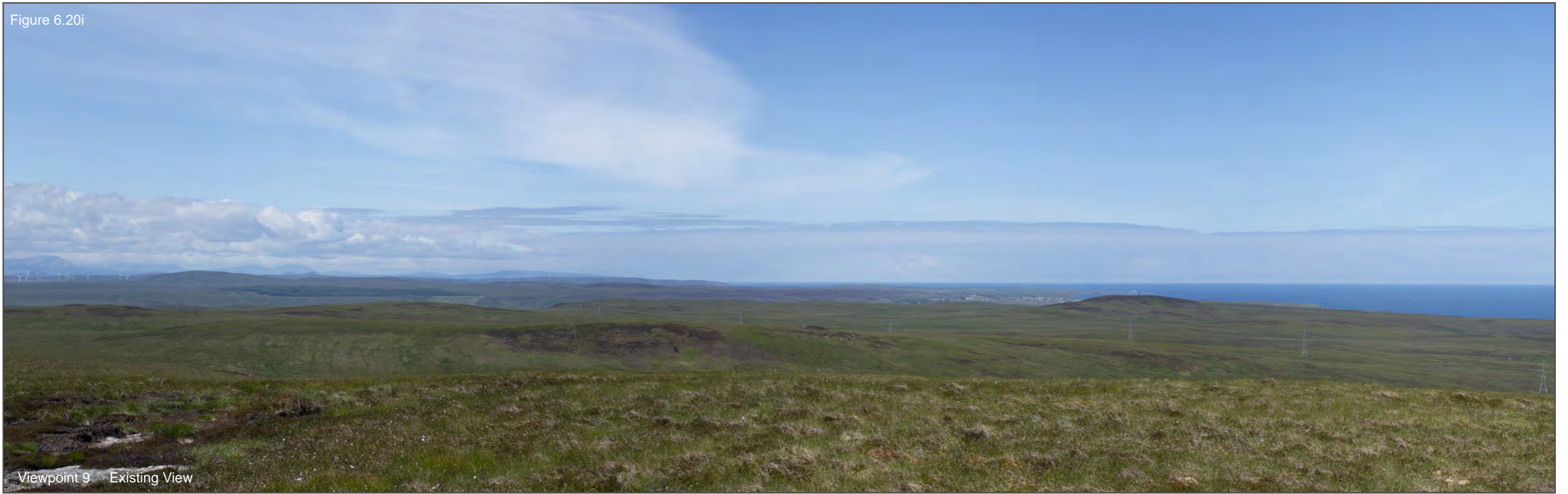
Viewpoint 9 Existing View