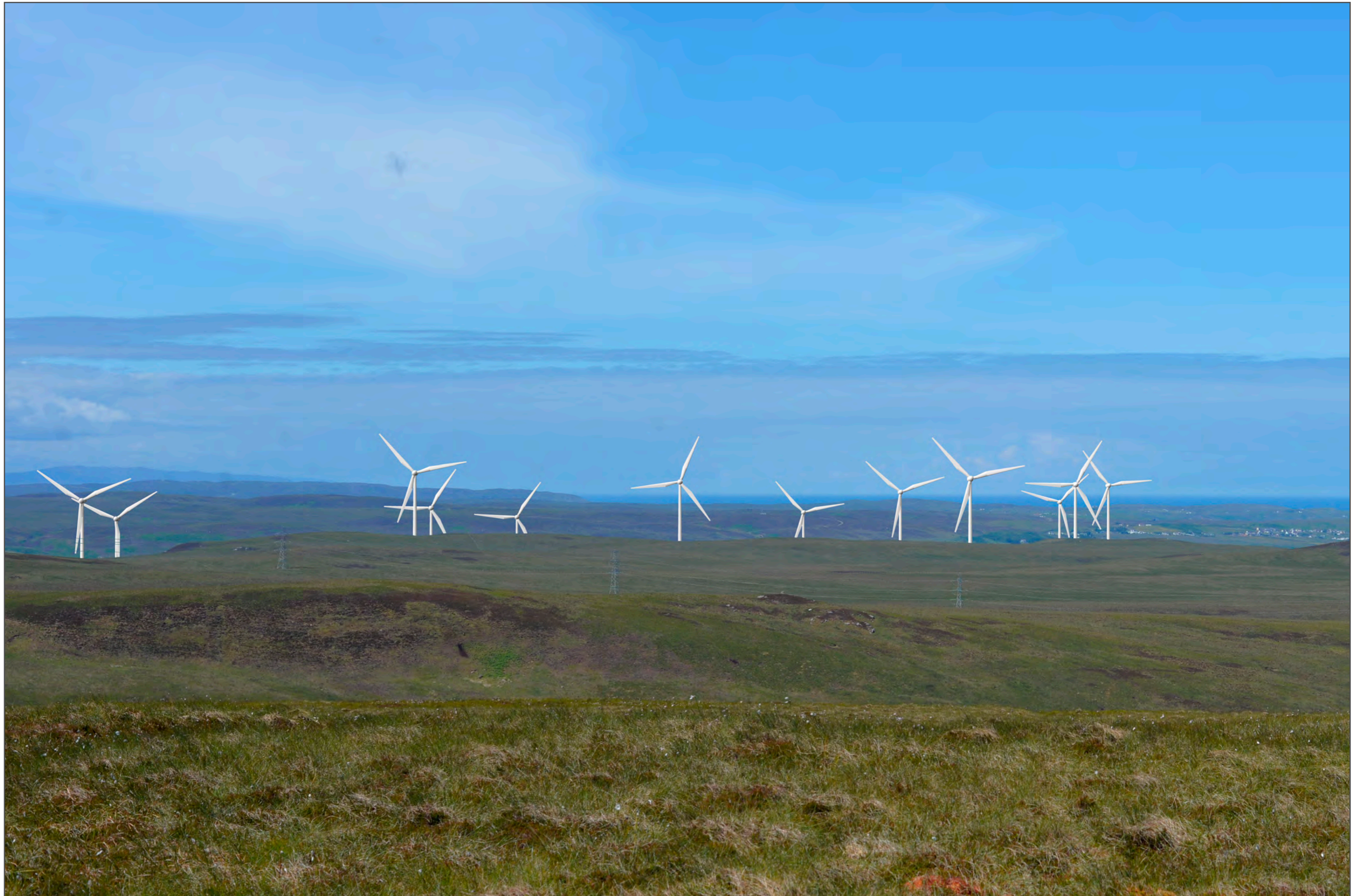
Viewpoint 9 (Figure 6.20k) Summit of Beinn Ratha

Distance to nearest turbine: 3450m Camera: Nikon D610 Focal Length: 75mm Camera height: 1.5m Date: 12/07/2019 12:02