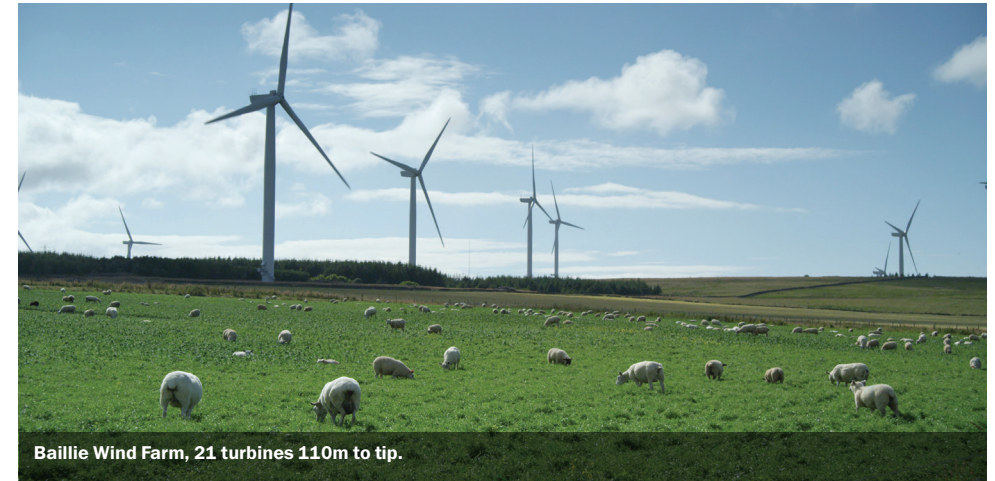
Baillie Wind Farm, 21 turbines 110m to tip.

Join our online exhibition: view the plans and meet the team.