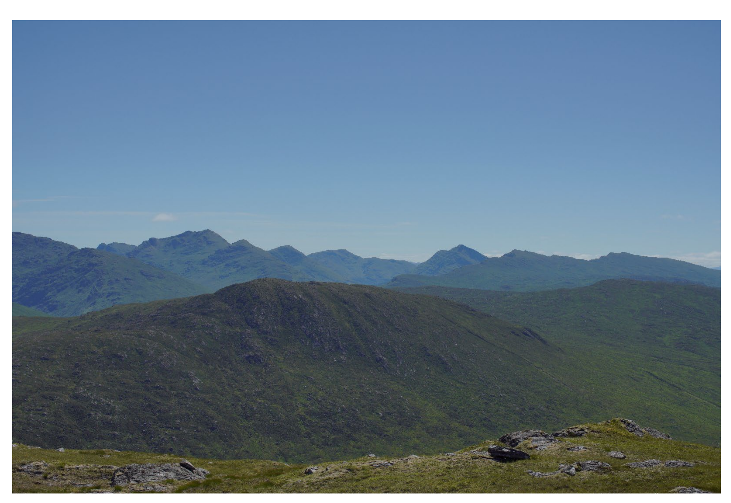
Figure 3 Panoramic views of the massive and remote south-western hills (WLA Quality 1) within Ben Lui WLA (View looking south from Troisgeach).