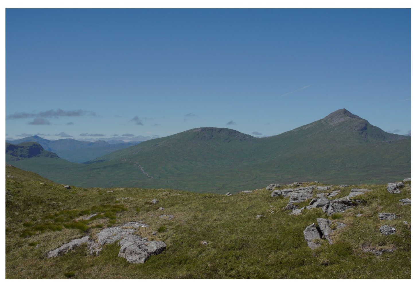
Figure 4 There is evidence of human elements within the interior of the Ben Lui WLA. This view north of Troisgeach illustrates an overhead line (OHL) and access track cutting through the landscape along Cleann nan Caorann. This interrupts the mountainous landscape and reduces the sense of remoteness and sanctuary (WLA Quality 1 and 3).