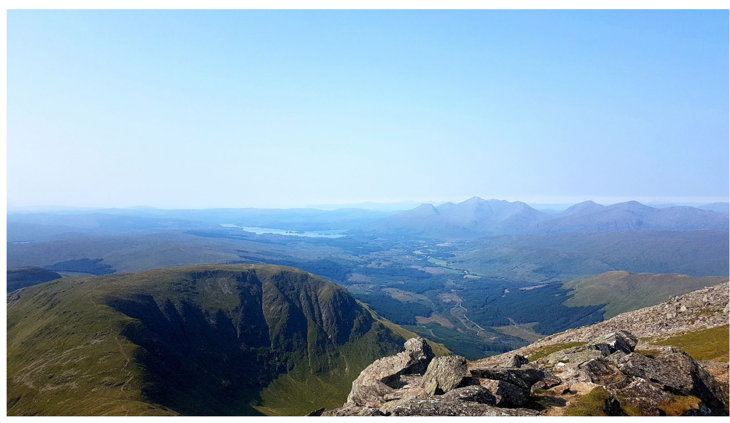
Figure 1 Human elements are present in views west from the summit of Ben Lui. The A85, settlement and extensive tracts of forestry are visible across the lower lying land to the west of the WLA, reducing the "sense of remoteness and sanctuary" (WLA Quality 1) experienced from this part of the WLA. The presence of these human elements helps define the extent of the WLA, and "interrupts the sense of a continuous mountain landscape" (WLA Quality 3) which extends across to Ben Chruachan and Stobb Daimh in the distance.