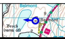
Figure 5.3.9e - Viewpoint 9: Belmont House, Unst - Comparative Wireframes View flat at a comfortable arms length. The principal distance is 812.5mm. This image provides landscape and visual context only.