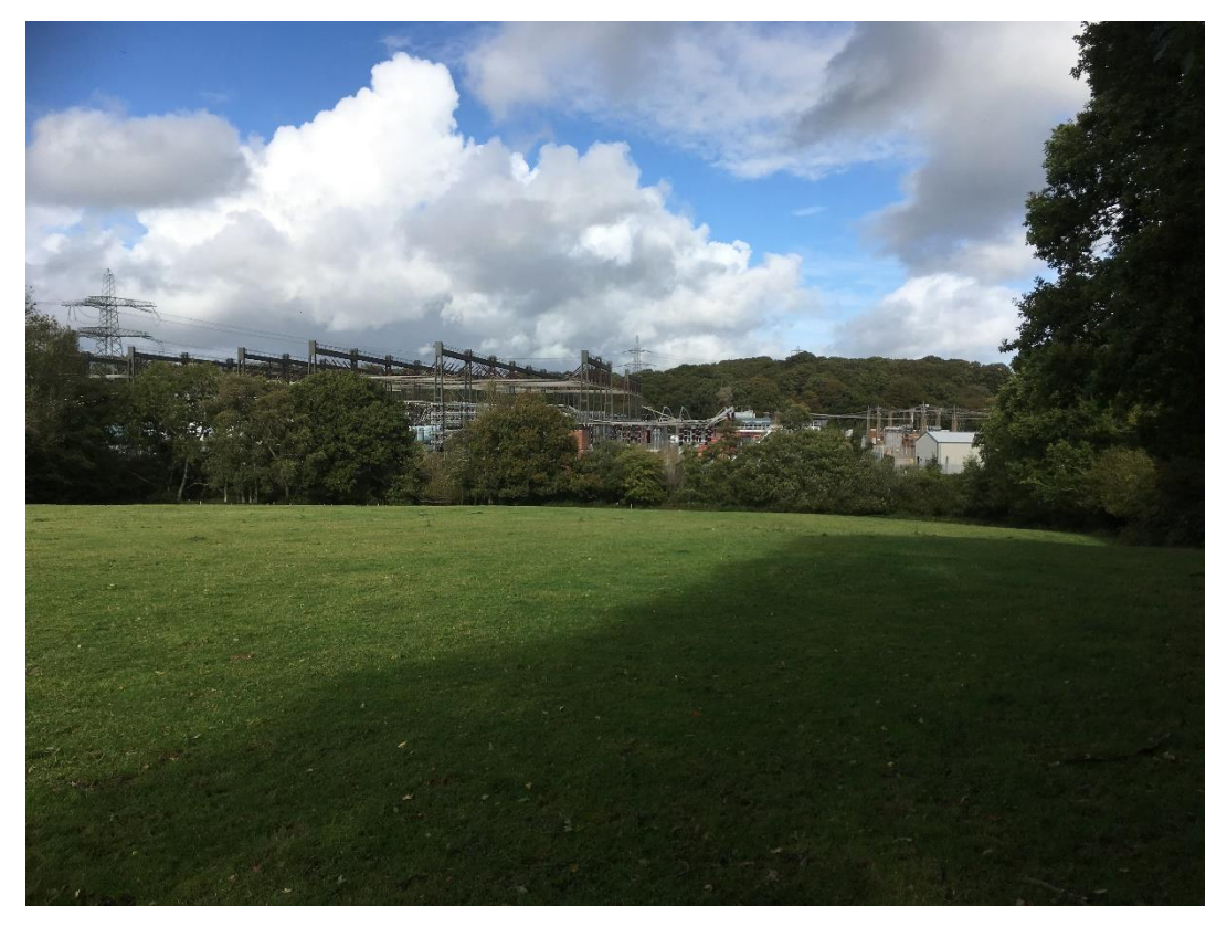
Plate 3. North towards pre-existing substation demonstrating screened topography in the far distance