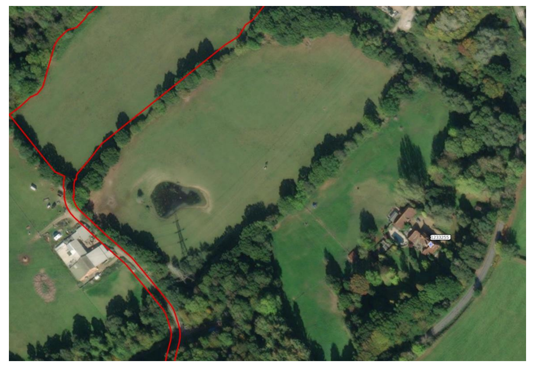
Plate 02. Satellite image of Grade II Potmans and location to area of proposed development (Red).