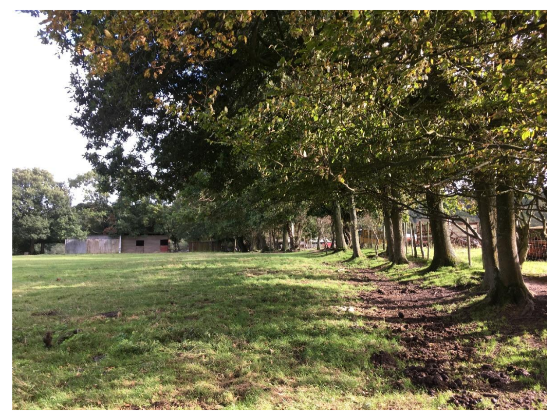
Plate 4. South-east view towards Potman's. Not visible due to vegetation screening.