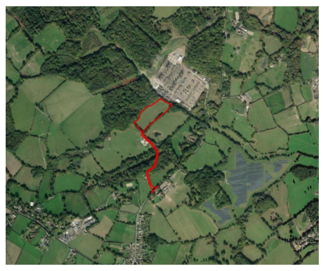
Plate 01. Satellite image of the area of proposed development (Red).